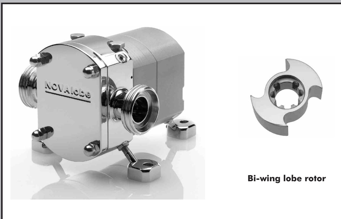
Bi-wing lobe rotor