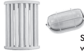
Sauna Light Cover with Sauna Light