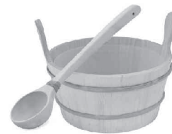
Pail and Ladle